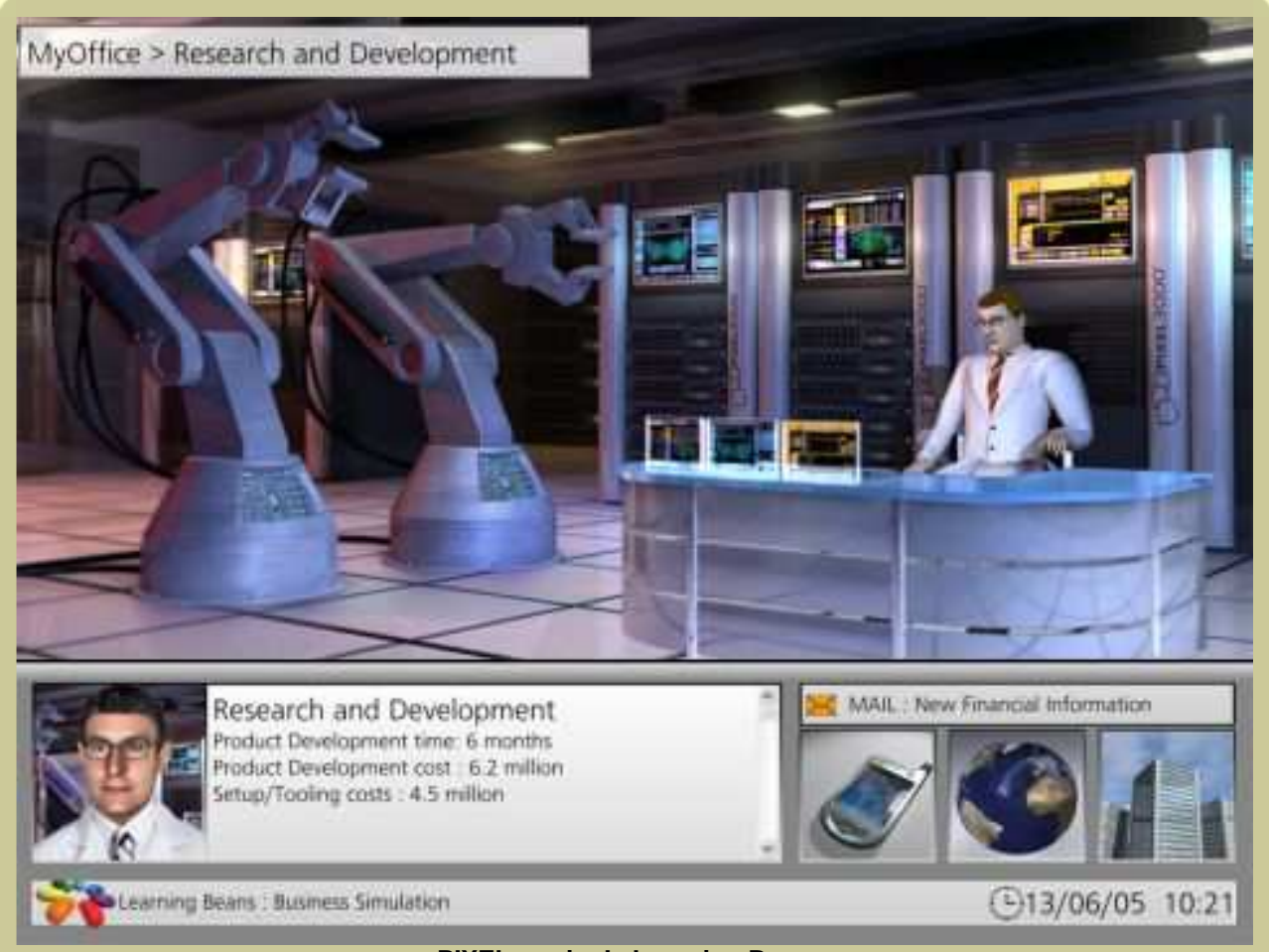
PIXELearning's Learning Beans.